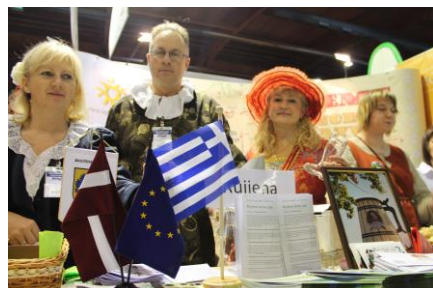
Balttour 2014 Riga, Latvia 7-9 February 2014

Vidzeme Tourism Association (VTA) presented CHARTS at the 21th International Travel Trade Fair "Balttour 2014" in Riga, Latvia. VTA introduced visitors and