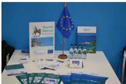
ITB Berlin 2014 Berlin, Germany 5 - 9 March 2014

and contents of the project and to promote CHARTS Award 2014. Project partnership established significant contacts with people working with the good practices promoted by the projects (i.e. traditional skills, accessible tourism and cycling for tourists) by sharing ideas and innovative proposals. BIT 2014 recorded more than 100 participating countries, 30.400 private travellers, 1.000 companies, 700 international buyers and 53.600 professionals operators.