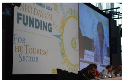
Info Day on EU funding Brussels, Belgium 20 March 2014

During these days NIRD disseminated the official leaflet of the project (in English and Romanian language), a flyer (containing a brief presentation of the project in Romanian language), as well as the CHARTS Award. This event brought together 280 companies from 24 countries like Israel, Macedonia, Bulgaria, Romania, Montenegro, Croatia, Turkey, Greece, Ukraine, Austria, Italy, Poland, Cyprus, Serbia, Moldova, Great Britain, Hungary, Jordan, Holland, Czech, China, Morocco, Malaysia and Egypt.