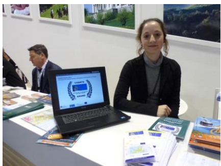
BIT 2014, Milano, Italy 3-15 February 2014

The fair was attended by 27,100 people, which is 15% more than in 2013, and five thousand of them were tourism professionals and invited guests. The whole exhibition presented 450 stands and 700 travel businesses from 38 countries.