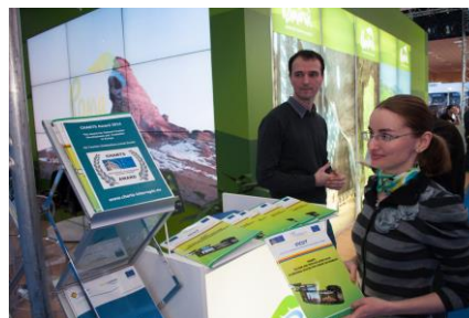
Romanian Tourism Fair Bucharest, Romania 13-16 March 2014

Around 5,700 accredited journalists from 81 countries and some 300 bloggers from 25 countries reported on events at ITB Berlin.