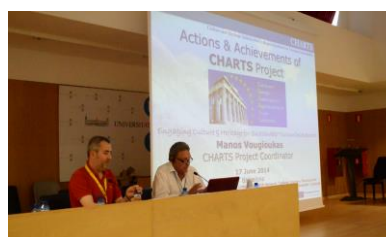
UNESCO / UNITWIN 3rd Conference Barcelona, Spain 16-20 June 2014

programmes and support under the 2014 - 2020 financial framework that are available for initiatives in the tourism sector. The info day focused on the most important EU programmes for the tourism sector and practical questions about types of tourism-related actions eligible for funding; types and levels of funding; who can apply and how to apply under Programmes such as COSME, ERDF, European Agriculture and Rural Development Fund, Creative Europe Programme, Horizon 2020, Erasmus+, European Social Fund, European Maritime and Fisheries. More information: http://ec.europa.eu/enterprise/newsroom/cf/itemdetail.cfm?item_id=7252&lang=en&tpa_id=136&title=Info-Day%3A-EU-funding-for-the-tourism-sector